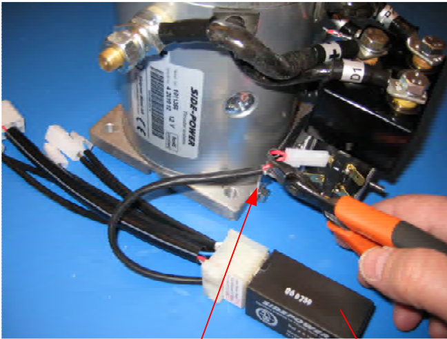
Cut red wire to control box