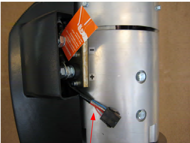
New motor loom