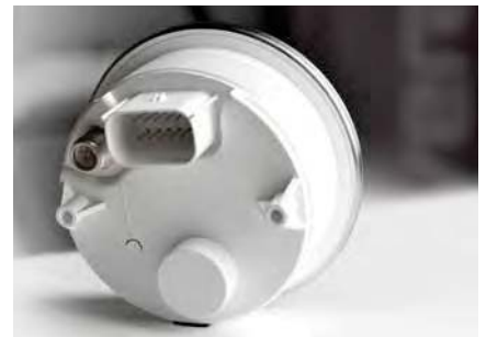
Water-sealed connector and NMEA 2000® DeviceNet plug