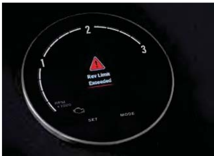
Setup local alarms and send them to other devices via NMEA 2000®

Specific information about your diesel engine is provided together with alarms, either received from the SAE J1939 bus or locally set through the embedded menu. Both 12V and 24V systems are supported, as well as EasyLink connectivity which allows your dashboard to be expanded with additional VMH 14 satellite displays to always keep your sensitive data under control. The embedded high-performance GPS receiver further enhances the display capabilities by adding speed, position and heading data.