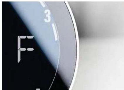
The finest quality in every detail